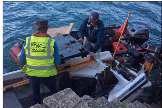
Manhandling large pieces of flotsam ashore from the work boats.