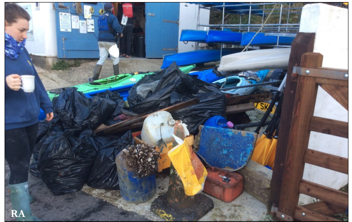
The fantastic team of River Clean-up volunteers and the main load of rubbish they collected!

We have been organising our river clean-ups for quite a few years now, but after adverts, phone calls etc there is always a moment where you wonder if anyone is going to turn up. Have we ordered enough pasties? Will the weather be good enough for us to get out?