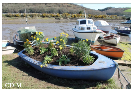
The boat dedicated to Mary South has been planted up....