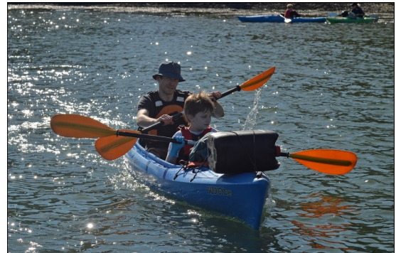
Kayak crew with a big oily drum on the foredeck.