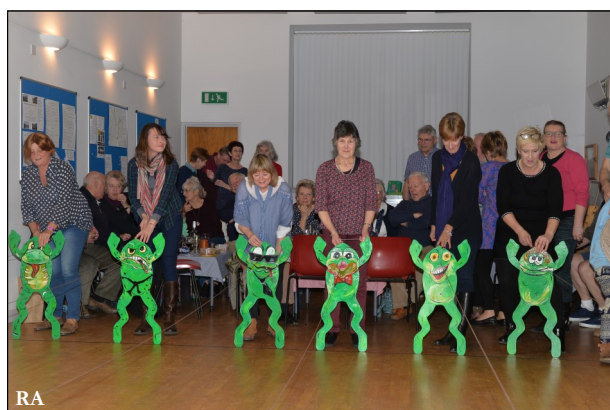
One of the froggy line-ups....