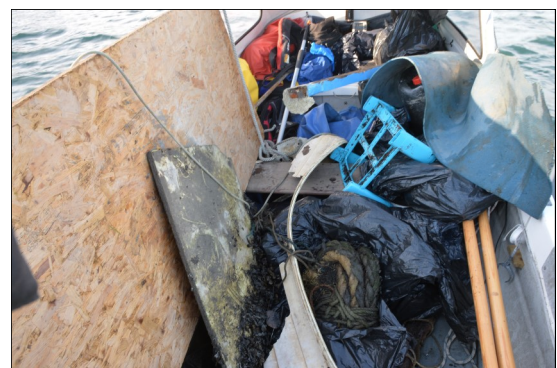
Longliner full of gash!