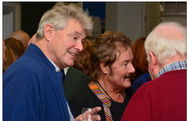
We Three Kings? Oh, sorry, there is only one King!