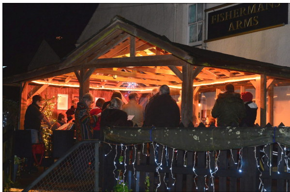
Carols at The Fisherman's Arms