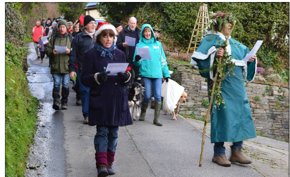
Wassailing at Golant, New Year's Day, 2018