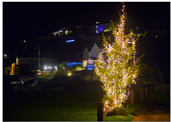
Village Green, with the pub looking inviting in the background