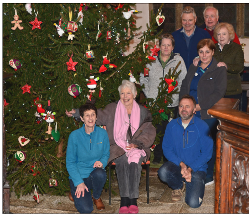
Bell ringing buddies at St Sampson's