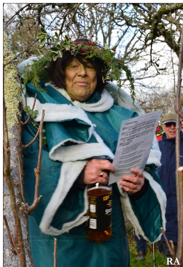
Our very own Green Man...