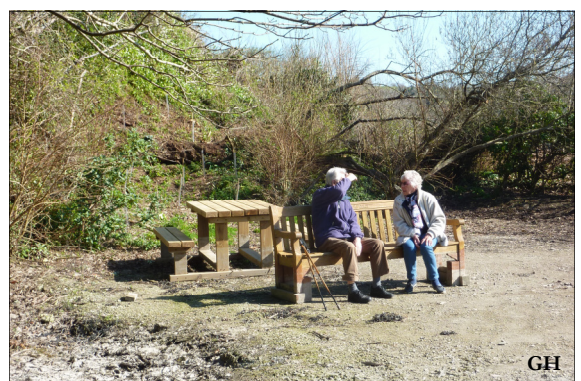
Two Golantians enjoying a chat in the spring sunshine!