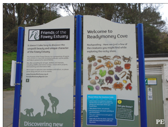
This attractive sign has a wealth of information about Readymoney Cove, as well as that of our local group.