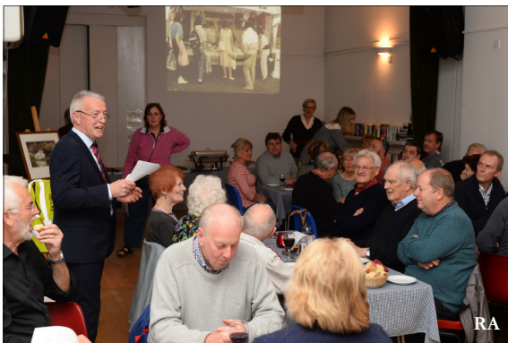
Golant Boat Watch's annual convivial Spring Get Together