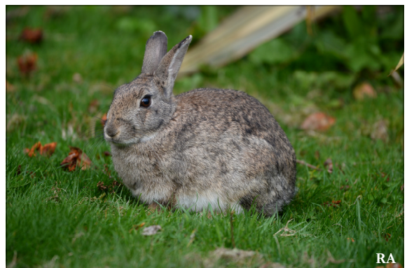
An early Easter bunny?