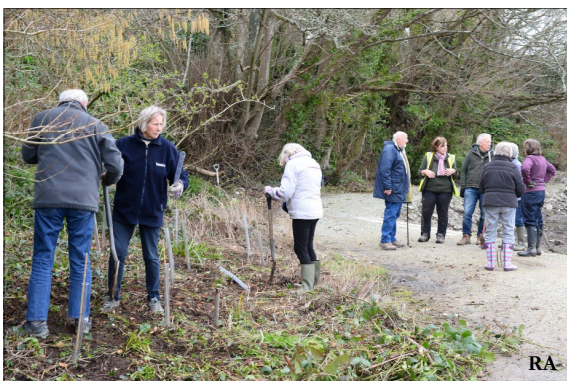
Some of the happy band of volunteers planting saplings