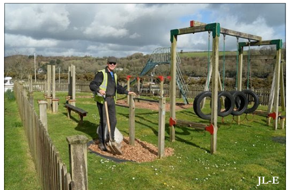
700 litres of play bark added to the children's playground