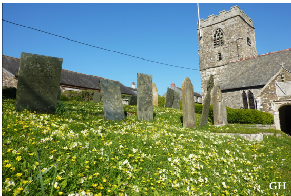
A glorious carpet of primroses & celandines in the churchyard