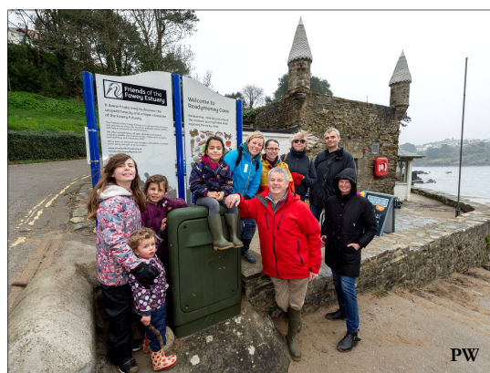
Friends of Fowey Estuary install the new sign at Readymoney Cove.