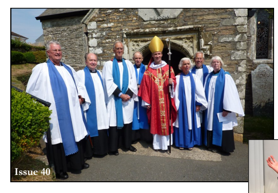
'A VIP Visitation'