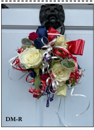
One of the Jubilee decorations!