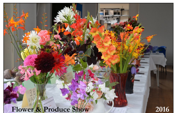
Flower & Produce Show