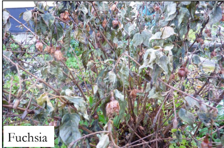
Demised & browned-off...

Whilst the week-long frosts were beautiful to see, they were devastating to many plants. Prior to this severe episode, our garden had been unusually full of blooms, many flowering out of season, and some in proliferation, such as a Fuchsia bush and a glorious patch of Nasturtiums. However, some specimens fought back bravely, including one Marigold and several Primrose plants. (See my After pics below!) I only managed to find 16 different blooms.