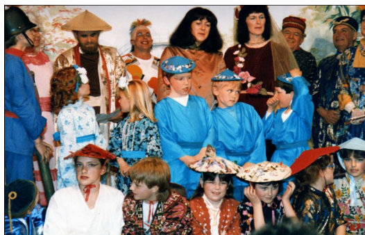
This Golant village panto, Aladdin, took place in about 1990. Pantos have been a regular event over many years, and we eagerly await the forthcoming 'Wind in the Willows' in February.

These photos reflect just a small selection of events which have taken place over many years in our warm & welcoming Village Hall.