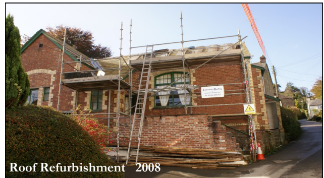
Roof Refurbishment 2008