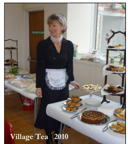
Village Tea 2010