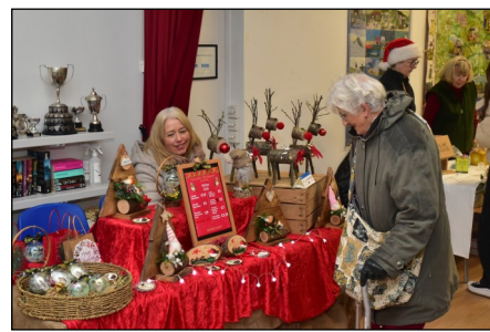
The recent Christmas Craft Market