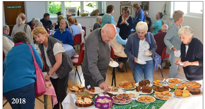
2018 Fund raising & conviviality at a Macmillan Coffee morning