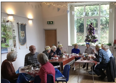
Christmas 2022- La Soupe Populaire, now a regular convivial social event