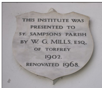
The opening of the 'Institute' was 120 years ago, on 15th January 1903. Golant's celebrations will be held later in the Spring...