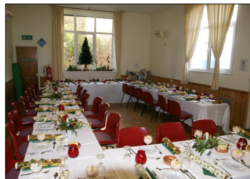
A Christmas welcome some years ago to the punters of the popular Thursday Kitchen