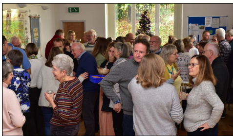
Our recent annual Meet & Greet which welcomes all village newcomers