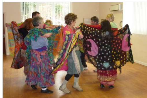
A colourful 'Belly Dancing' group, who were exploring forms of 'Middle Eastern Dance' in 2013. The headline for that issue was- 'No Shades of Grey here!'

Read more about recent events in this issue, and spot other photos (dated) placed randomly within, which show many of the diverse activities enjoyed over the past years and which have featured in The Golant Pill .