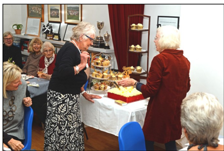
A surprise Special Birthday tea party