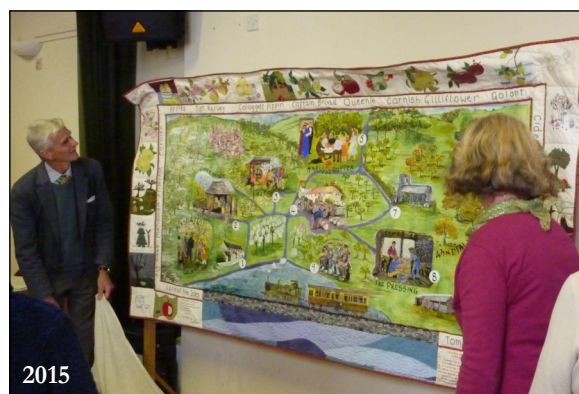
The unveiling of the Cider Heritage Map at Apple Day